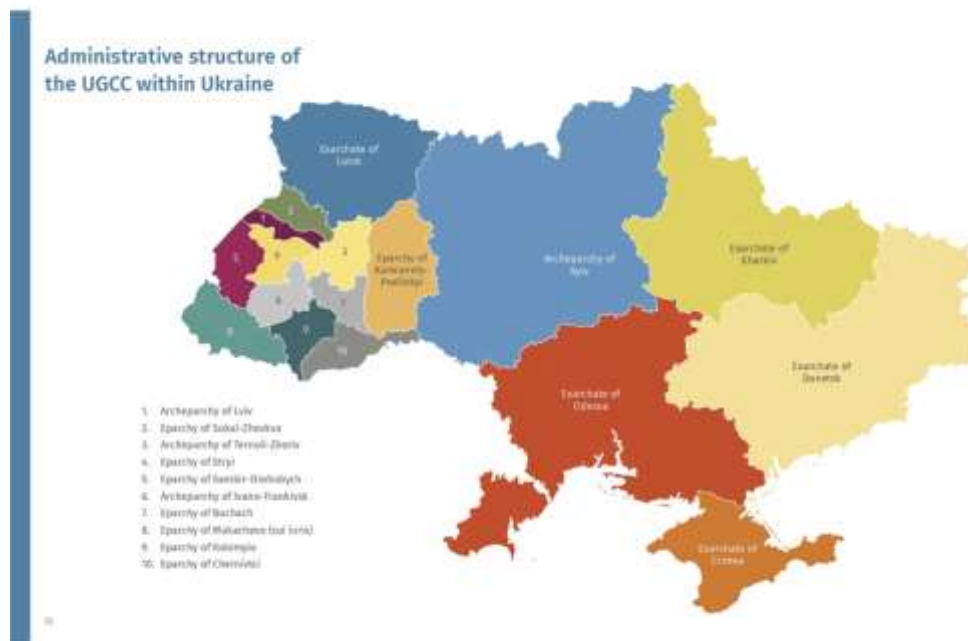
Map of the dioceses of the Ukrainian Greek Catholic Church

Annual Report PATRIARCHAL CURIA Ukrainian Greek Catholic Church 2019