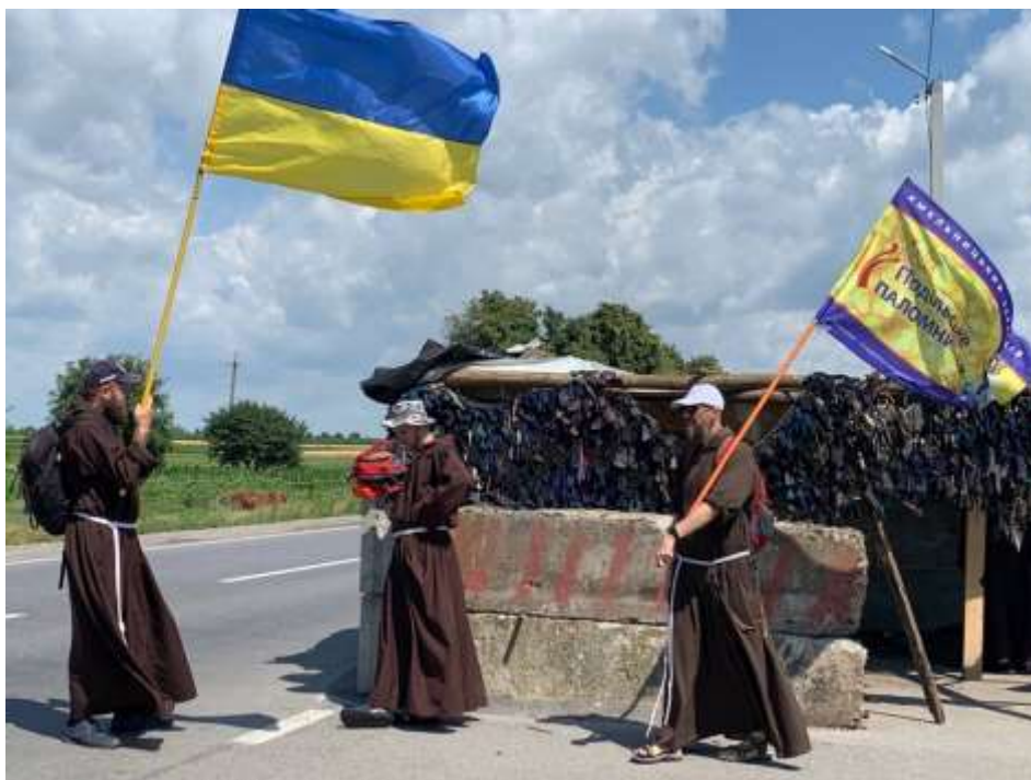
Warriors of Peace and Prayer!

Capuchin brothers at a checkpoint in July 2022, during a pilgrimage to Ostropol, Lubar, Ukraine