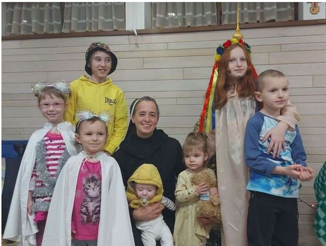
Christmas celebrations at the Sisters house in Briuchovychi, January 2023 - UKRAINE / LVIV The catechist sisters of St. Anna could celebrate the joy of St. Nicholas and Christmas with their refugees in their home. ACN benefactors donations funded a car for the catechist Sisters of St. Anna in Briuchovychi, Lviv, to keep going... and smiling!