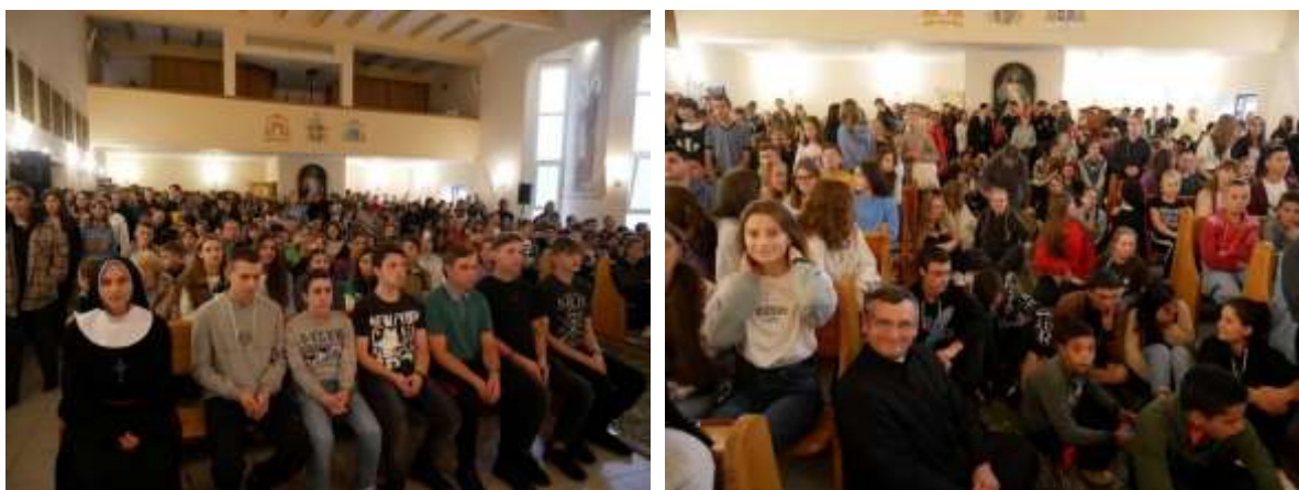
Youth day. RC diocese of LVIV

ACN supported projects which reached more than 1,700 children and youths, many refugees.