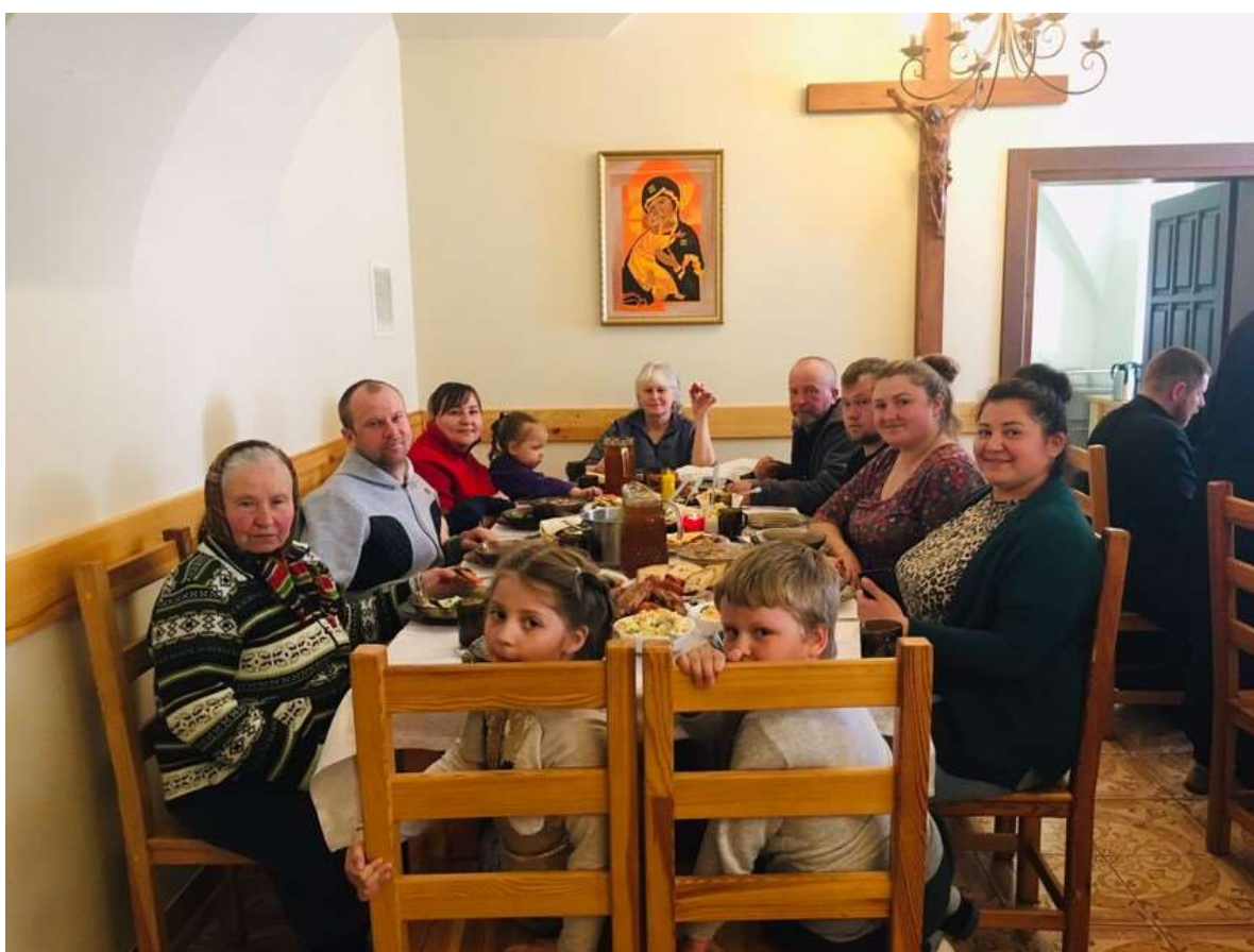
UKRAINE / KAMYANETS-PODILSKYI-LAT 22/007

“In Tyvriv, the Oblates normally have their retreat house, but at the moment they only care for the internally displaced people. For the Oblates it is an opportunity to live out charity in action but also to evangelise these people, because indeed they like to come to pray, especially to pray the rosary!”