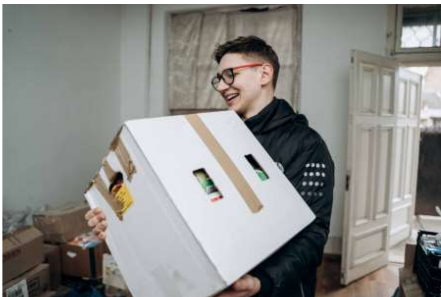
Seminarian helping out at St Josaphat's seminary in Ivano-Frankivsk during the war

In the last year, we continued our support even though at times classes were suspended and as in the case of the Ivano-Frankivsk seminarians for example, seminarians switched their lessons for helping care for the IDPs taking shelter in their seminary. Now lessons have mostly resumed, and it is vital that the future shepherds continue to receive the best possible formation. In 2022, almost 800 seminarians received support from ACN grants.