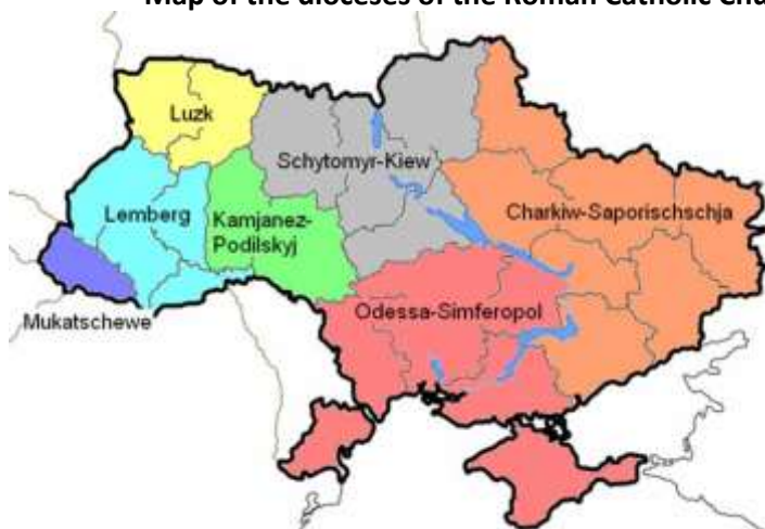
Map of the dioceses of the Roman Catholic Church in Ukraine 8

In Ukraine there is also a very small Armenian Catholic minority, which is cared for by the Ordinariate