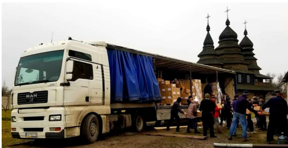
Distribution of humanitarian aid by the Basilian Fathers in Kherson. ODESA-UCR Car for the Basilians in Kherson during the war.