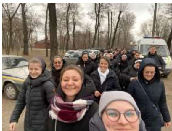
UKRAINE / NATIONAL 21/02875

Training grant for 2 novices of the Servants of the Immaculate Virgin Mary in Ukraine for 2022