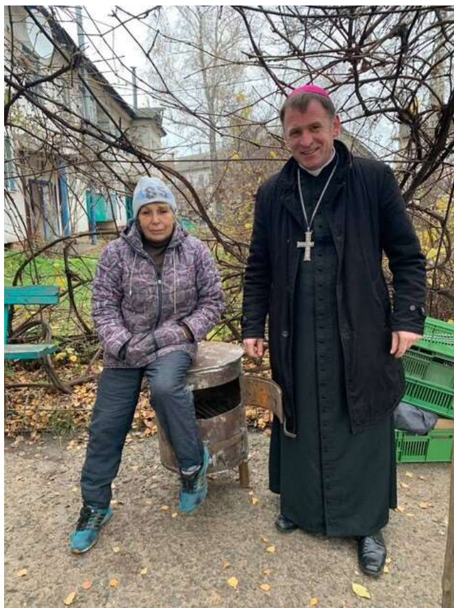
Here Mons. Pavlo Honcharuk, Bishop of the RC diocese of KHARKIV-ZAPORIZHZHYA 50 portable stoves for the parishes of the Archdiocese of Kharkiv-Zaporizhzhya during the war.

The Sisters of the Angels are a congregation of women without habit whose mission is to reach where priests or religious sisters cannot. One of their main tasks is to educate children in the spirit of Christian values. There are 12 sisters in 5 institutions across Ukraine.